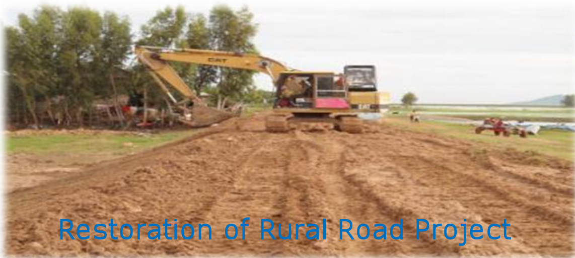
Restoration of Rural Road Project