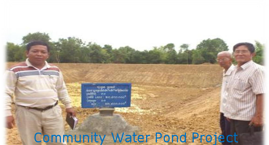
Community Water Pond Project