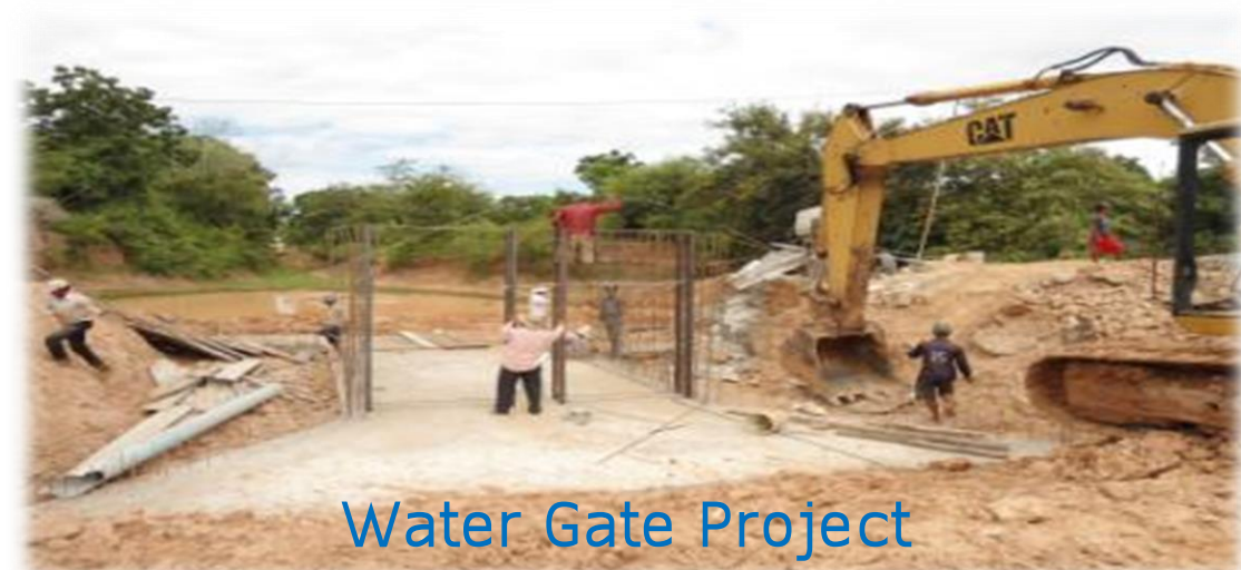
Water Gate Project