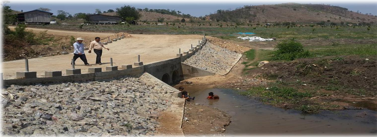
Water Gate Project and Spilt Water Dam